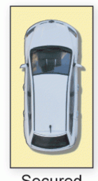
Secured Carspace (Not In Position)