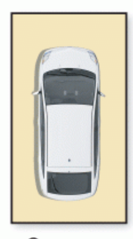
Carspace (Not In Position)