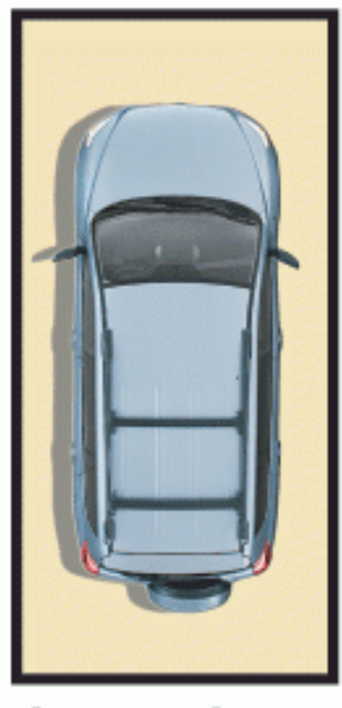
CARPORT (NOT IN POSITION) (ACCESS VIA JUBILEE PLACE)