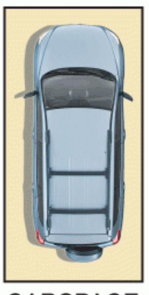
CARSPACE (NOT IN POSITION)