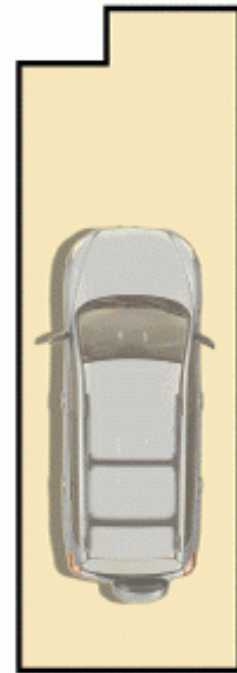
CARSPACE (NOT IN POSITION)