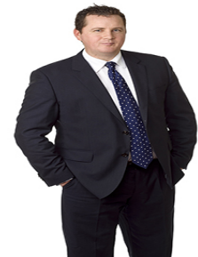
> Paul Richards

An elevated formal living room is awash with abundant natural light, featuring an inbuilt stone buffet and opening directly out to a spacious elevated timber decking, superbly laid out for stylish entertaining. A vast open plan living and dining space includes a wall mounted Heat-n-Glo fireplace, an inbuilt entertainment unit, and a stunning double height atrium dining space. Flowing seamlessly out to the decking, the floorplan harmoniously combines elegant 13 Sweyn Street