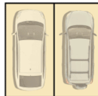
2 CARSPACES (NOT IN POSITION)