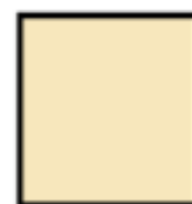
STORAGE (NOT IN POSITION)