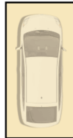
CARSPACE (NOT IN POSITION)