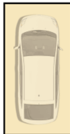
CARSPACE (NOT IN POSITION)