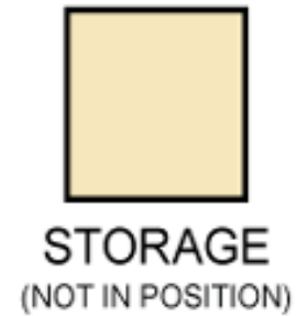
STORAGE (NOT IN POSITION)