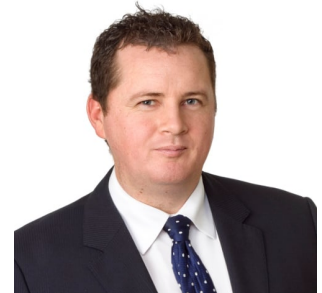
> Paul Richards

This pocket of Surrey Hills is one of the most sought-after in the area, so securing this amazing family offering should be number one on your list. The perfect balance of period and modern of this home is outstanding, with classic timber floors and traditional windows complemented by a variety of contemporary features throughout. An open and welcoming entry makes way for two amazing highlights at the front of the layout, which includes the spacious master bedroom with WIR and dual vanity marble ensuite, and the large formal lounge room with open fireplace.