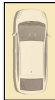
CARSPACE (NOT IN POSITION)