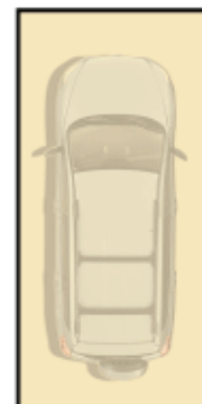
CARSPACE (NOT IN POSITION)