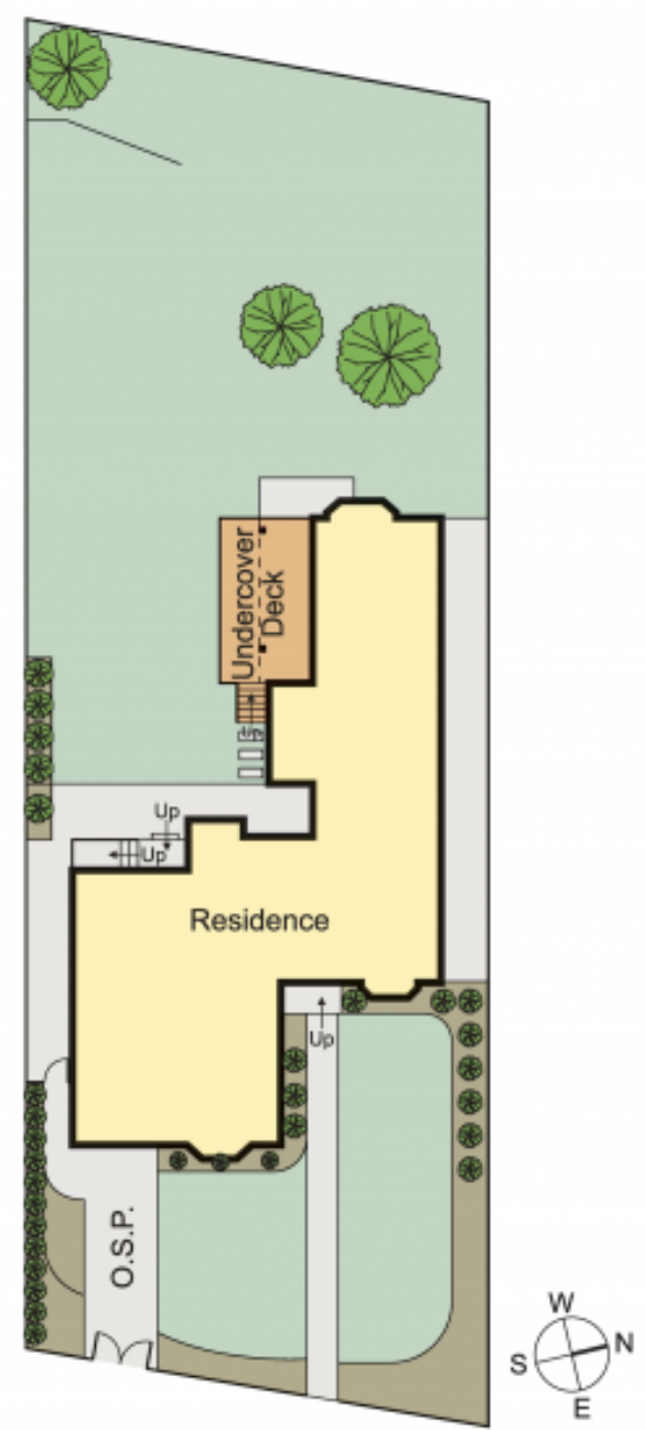
29 Elm Grove, Kew East