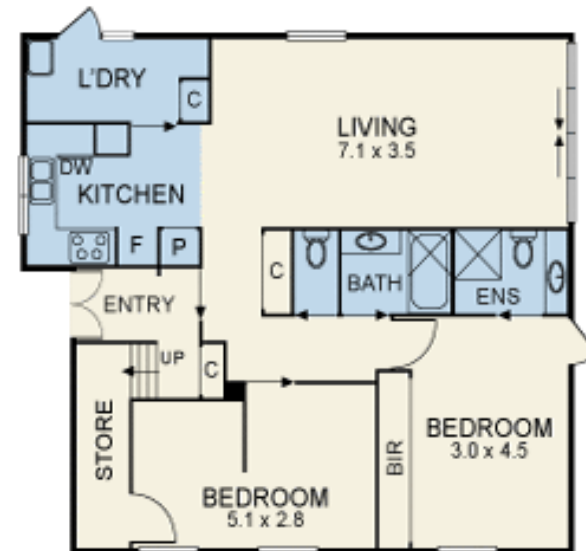
UNIT NO 1

Disclaimer: The artist impressions and floorplans are indicative only, are not to scale and do not form part of any Contract of Sale. Any dimensions, finishes or specifications depicted are subject to change without notice. Consultants and agents do not warrant the accuracy of any information provided and do not accept any liability for negligence, any error, misrepresentation, discrepancy in the information or reliance thereon.