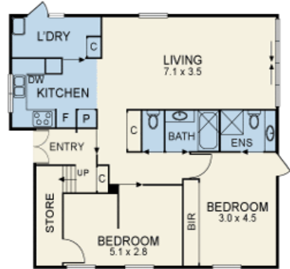
UNIT NO 1

Disclaimer: The artist impressions and floorplans are indicative only, are not to scale and do not form part of any Contract of Sale. Any dimensions, finishes or specifications depicted are subject to change without notice. Consultants and agents do not warrant the accuracy of any information provided and do not accept any liability for negligence, any error, misrepresentation, discrepancy in the information or reliance thereon.