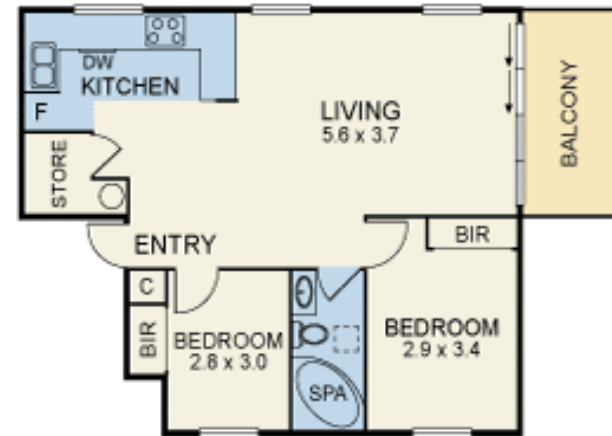
UNIT NO 2